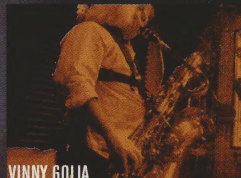
VINNY GOLIA Soprillo, Curved & Straight Soprano, Tenor & Bass Saxophones

The imaging of the saxophone ensemble is as it was recorded;